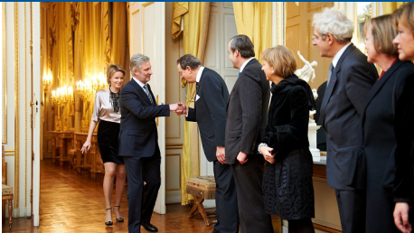
Council of presidents met Prince Philippe and Princess Mathilde on Dec. 2, 2010

Competitiveness of our companies will more and more depend on access to third markets, access to finance and access to raw materials. Therefore, the EU has to promote competitive implementation of new capital rules for banks at the global level, progress in the Doha trade negotiations in the WTO and keep on in the fight against protectionism and focus on strengthened partnership for energy and raw materials. With timely and appropriate political decisions, today's recovery can be sustained.